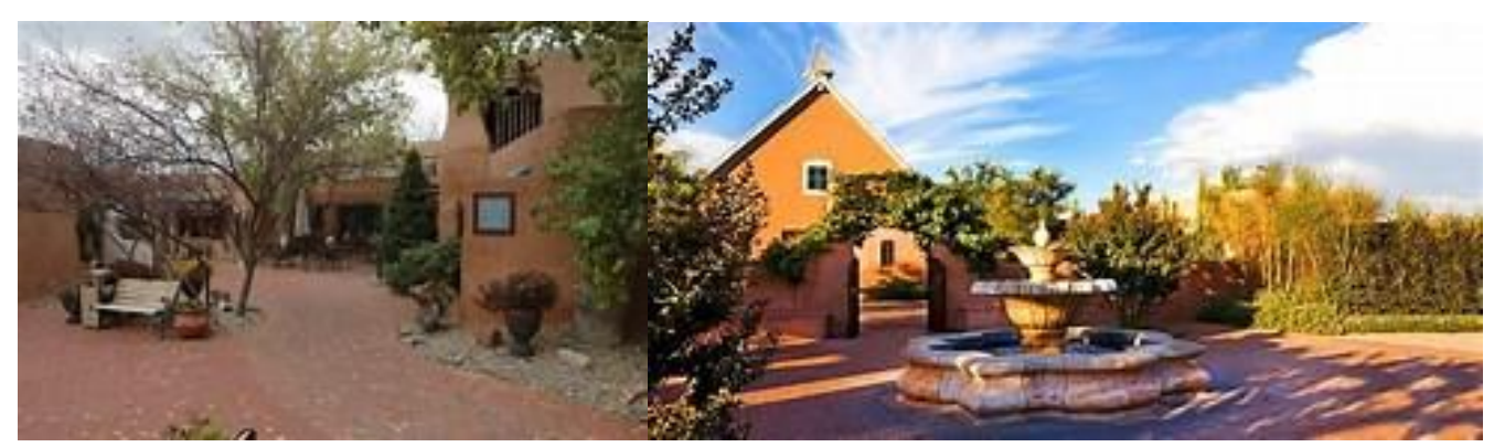
Old Town Albuquerque