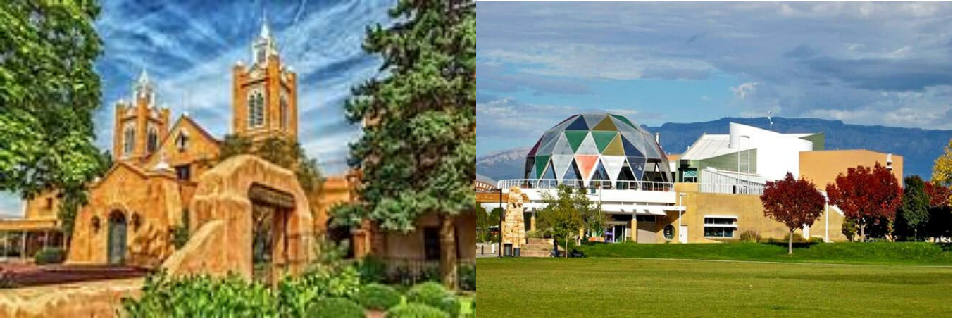
San Felipe de Neri Church