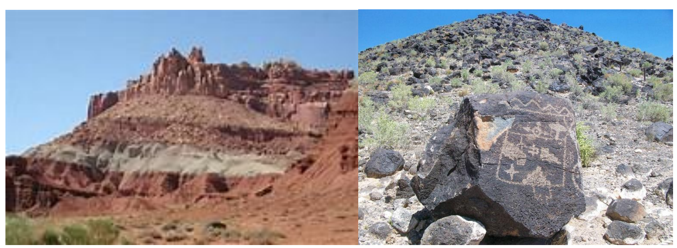
Petroglyph National Monument