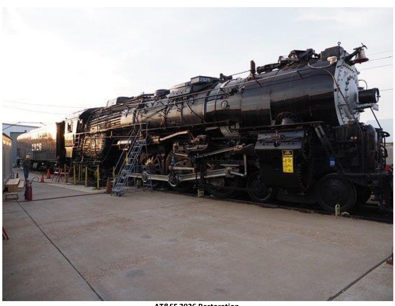
AT&SF 2926 Restoration