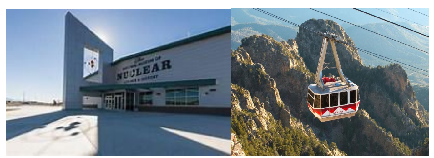
Museum of Nuclear Science & History